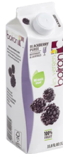
BLACKBERRY PUREE AMBIENT BOIRON 6/1 LT #845108