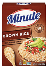
RICE BROWN WGR INSTANT MINUTE 12/14 OZ #422513