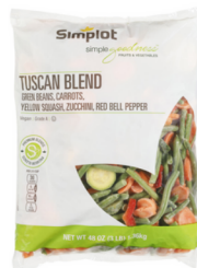
VEGGIE BLEND TUSCAN SIMPLOT 8/3 LB #700231