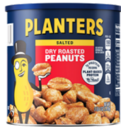
PEANUTS DRY ROASTED SALTED PLANTERS 6/52 OZ #341214