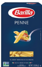
PASTA PENNE BARILLA 12/16 OZ #372086