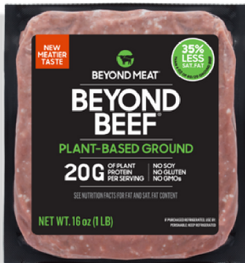
MEAT MEATLESS BEYOND BURGER GROUND BEYOND MEAT 6/2 LB #111718