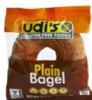
IW PLAIN GTF UDIS BAGEL 72/2 OZ #960634