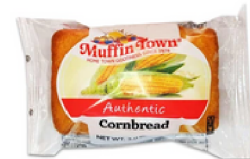
LOAF WGR MINI CORNBREAD IW MUFFIN TOWN 72/2 OZ #924819