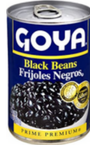
BLACK BEANS GOYA 24/15.5 OZ. #920567