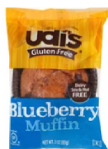
GTF IW BLUEBERRY UDIS MUFFIN 36/3 OZ #960649