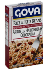
RICE & RED BEANS GOYA 24 / 8 OZ #422401