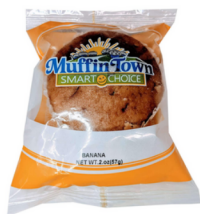
MUFFIN BANANA IW RDF MUFFINTOWN 96/2 OZ #924822