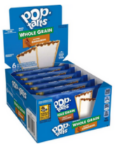
POPTART BROWN SUGAR CINNAMON FROSTED KELLOGGS 72/2 CT #110220