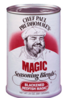
BLACKENED REDFISH MAGIC MAGIC SEASONING, 4/24 OZ #481357