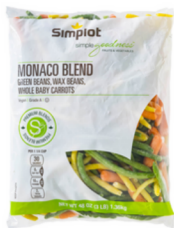
VEG MONACO BLEND SIMPLOT 8/3 LB #700231