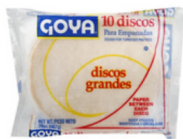
DOUGH EMPANADA DISCS 7 GOYA 24/20 OZ #931008