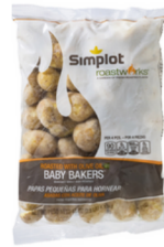
POTATO ROASTED RED W/ ROSEMARY SIMPLOT 6/2.5 LB #831501