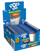
POPTART BROWN SUGAR WGR 12/10 KELLOGGS 12/10 CT #110224