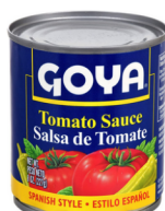
TOMATO SAUCE GOYA 48 / 8 OZ #524802