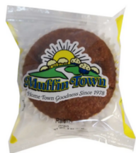
MUFFIN BRAN WW IW MUFFINTOWN 96/2 OZ #909482