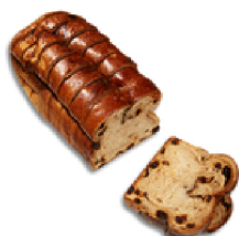
BREAD CINNAMON RAISIN SLICED ROCKLAND 1/LOAF #120146