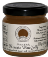
MOSCATO WINE JELLY PRUNOTTO #090480, 12/3.8 OZ