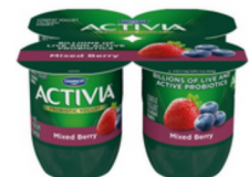
ACTIVIA MIXED BERRY DANNON YOGURT 24/4 OZ #001975