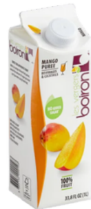
MANGO PUREE AMBIENT BOIRON 6/1 LT #845111