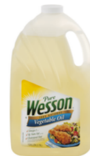
OIL VEGETABLE WESSON 4/1 GAL #350631