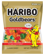
CANDY GUMMY BEARS HARIBO 12/5 OZ #134413