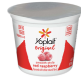
VARIETY RASPBERRY PEACH YOPLAIT YOGURT 48/4 OZ #061264