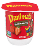
DANIMALS STRAWBERRY DANNON YOGURT 48/4 OZ #041012