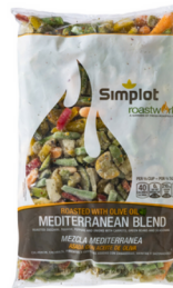
VEGGIE BLEND MEDITERRANEAN SIMPLOT 6/2.5 LB #941501