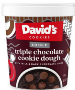
COOKIE DOUGH CHOCOLATE TRIPLE DAVIDS COOKIE 12/12 OZ #995464