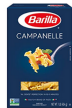
PASTA CAMPANELLE BARILLA 12/16 OZ #372010