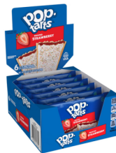
POP TART STRAW FROSTED KELLOGGS 72/3.5 OZ, #110219