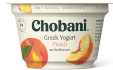
YOGURT GREEK PEACH FFR CHOBANI 12/5.3 OZ #82147