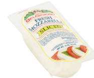
MOZZARELLA FRESH SLICED BELGIOIOSO 8/1 LB, #030607