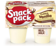
PUDDING VANILLA FFR SNACK PACK 12/4 PCK #411234