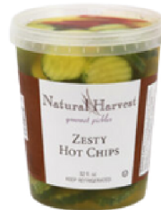
HOT AND ZESTY CHIP HARVEST PICKLE 12 / 32 OZ # 391549