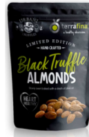
BLACK TRUFFLE ALMONDS URBANI #340426, 8/4OZ