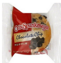
MUFFIN CHOC CHIP IW 4OZ OTIS SPUNKMEYER 24/4 OZ #920628