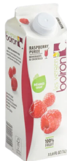
RASPBERRY PUREE AMBIENT BOIRON 6/1 LT #845110