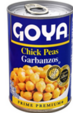
GARBANZO BEAN GOYA 24/15.5 OZ #920597