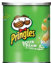
PRINGLES SOUR CREAM & ONION 12/1.4 OZ #441048