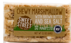
MARSHMALLOW MANIFESTO BAR SWEET STREET 40/2.1 OZ #160578