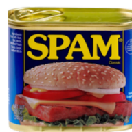
SPAM REDUCED SALT #039242, 12/12 OZ