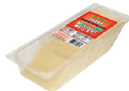
WHITE CHEDDAR SLICED CABOT 4/2.5 LB, #031028