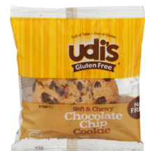
FTD IW CHOC CHIP UDIS COOKIE 36/1.7 OZ #960651