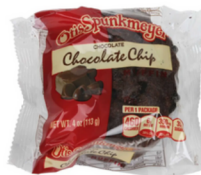
MUFFIN IW CHOC CHOC CHIP OTIS SPUNKMEYER 24/4 OZ #920630