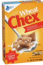
CHEX CEREAL GENERAL MILLS 10/14 OZ, #261410