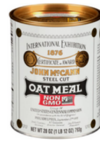
OATMEAL IRISH MCANN 12/28 OZ, #264615