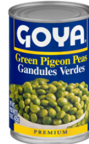
PIGEON GREEN LRS, GOYA #983250, 24/15 OZ