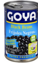
BLACK BEANS LRS GOYA 24/15.5 OZ #920596