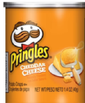
PRINGLES CHEDDAR 12/1.4 OZ #441050