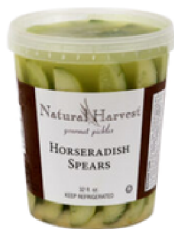
HORSERADISH SPEAR PATRIOT PICKLE 12 / 32 OZ #391550