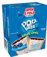
POP TART BLUEBERRY FROSTED KELLOGGS 72/2 CT #110217