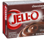
CHOCOLATE INSTANT PUDDING JELLO 24/3.9 OZ #80602