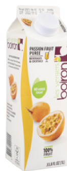
PASSION FRUIT PUREE AMBIENT BOIRON 6/1 LT #845114