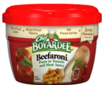
BEEFARONI CHEF BOYARDEE 12/7.5 OZ #531209