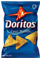
CHIPS LSS COOLER RANCH DORITOS FRITO LAY 64/1.75 EA #443613