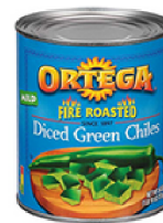
CHILIS GREEN DICED ORTEGA 12 / 26 OZ #390619