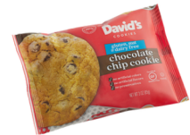
GTF IW CHOC CHIP DAVIDS COOKIE 24/3 OZ #921022