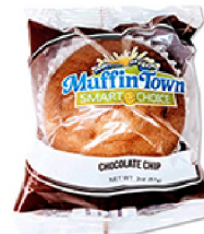
MUFFIN WGR CHOC CHIP IW MUFFINTOWN 48/3.6 OZ #924834