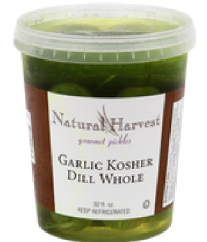
KOSHER DILL WHOLE HARVEST PICKLE 12/32 OZ #391547