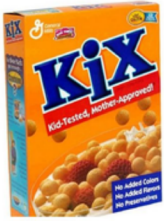
KIX CEREAL GENERAL MILLS 4/25 OZ, #174101