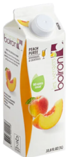
PEACH PUREE AMBIENT BOIRON 6/1 LT #845115