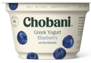
YOGURT GREEK BLUEBERRY FFR CHOBANI 12/5.3 OZ #082149