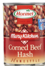
CORNED BEEF HASH HORMEL 12/14 OZ #730613