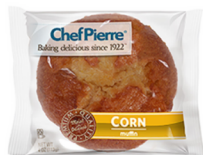
CORN MUFFIN IW CHEF PIERRE 24/4 OZ #924811