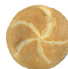
ROLL KAISER 5" SLICED ROCKLAND 1/DOZ #120402