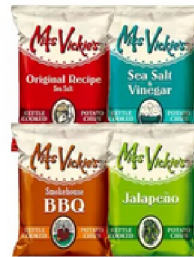
CHIPS LSS POTATO VARIETY PK MISS VICKI 60/1.375 EA #443614