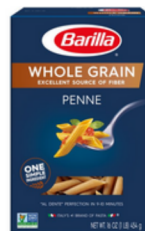
PASTA PENNE WGR BARILLA 8/16 OZ #371060