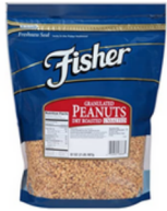
PEANUTS DRY ROASTED SLT FISHER 3/32 OZ #342555