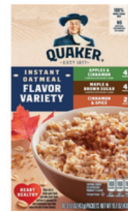
OATMEAL INSTANT VARIETY QUAKER 12/15.1 OZ #261219