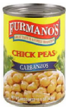
GARBANZO BEAN FURMANO 24/15.5 OZ, #73859