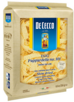
PASTA EGG PAPPARDELLE DECECCO 12 / 8.8 OZ #371027