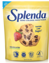
SPLENDA SUGAR SUBSTITUTE SPLENDA 8/9.7 OZ #491202