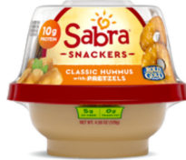
HUMMUS CLASSIC W. PRETZEL SABRA 12/4.56 OZ #61675