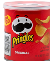
PRINGLES ORIGINAL 12/1.4 OZ #441043