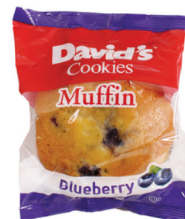
MUFFIN BLUEBERRY CRUMB DAVIDS 12 / 6 OZ #921133