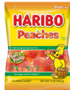
CANDY PEACHES HARIBO 12/5 OZ #134400