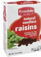
RAISINS SEEDLESS NATURAL KRASDALE 24/15 OZ #790500