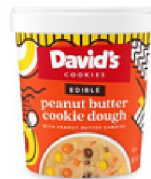
COOKIE DOUGH PEANUT BUTTER DAVIDS COOKIE 12/12 OZ #995468