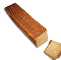
ROCKLAND PULLMAN WHEAT 1/LOAF #120078 WHITE 1/LOAF #120072