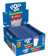
POPTART STRAWBERRY WGR KELLOGGS 12/10 CT #110225