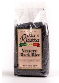
RICE BLACK ITALIAN UNCLE BENS 6/17.6 OZ #130020