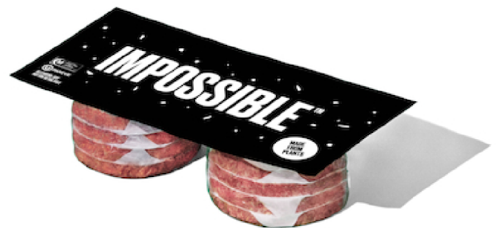
BURGER MEATLESS PATTIES BEYOND MEAT 40/4 OZ #878309