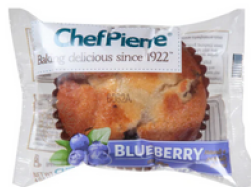
MUFFIN BLUEBERRY IW CHEF PIERRE 24/4 OZ # 910048