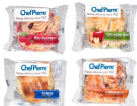
DANISH ASST IW 3OZ T&S CHEF PIERRE 24/3 OZ #922399