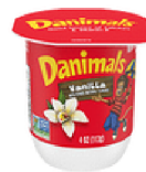
DANIMALS VANILLA DANNON YOGURT 48/4 OZ #041010