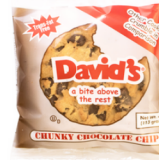
CHOCOLATE CHUNK T&S DAVIDS COOKIE 32/4 OZ #921029