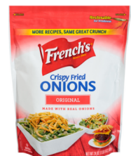
ONION CRISPY FRIED FRENCHS 6 / 24 OZ #790404