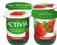
YOGURT ACTIVIA STRAWBERRY DANNON 24/4 OZ #001974