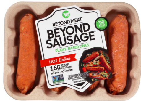
SAUSAGE PLANT BASED HOT BEYOND MEAT 8/14 OZ #111715