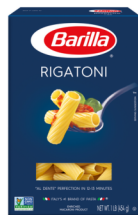
PASTA MEZZI RIGATONI BARILLA 12/16 OZ #371256