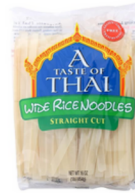
RICE NOODLES THIN A TASTE OF THAI 6/1 LB #561360