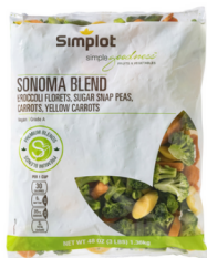
VEGGIE BLEND SONOMOA SIMPLOT 8/3 LB #941500