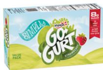
STRAWBERRY GOGURT YOPLAIT YOGURT 96/2 OZ #071268