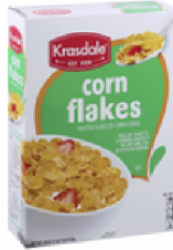
CRISPY RICE BOXED KRASDALE CEREAL 12/12 OZ, #174960