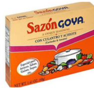
SAZON ORIGINAL GOYA 24/12 ENVL #920572