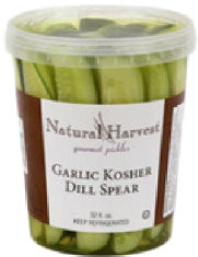
GARLIC DILL SPEAR HARVEST PICKLE 12 / 32 OZ #391545