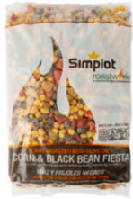
CORN & BLACK BEANS ROASTED SIMPLOT, 6/2.5 LB #883114