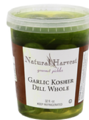
GARLIC DILL CHIPS KOSH HARVEST PICKLE 12 / 32 OZ #391546