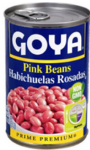
BEANS PINK GOYA 24/15.5 OZ, #920595