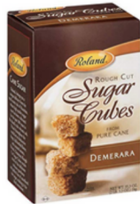
SUGAR RAW CUBES BROWN ROLAND 8/35 OZ #494522