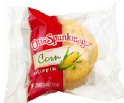
MUFFIN CORN IW OTIS SPUNKMEYER 24/4 OZ #920627