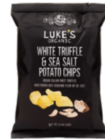
WHITE TRUFFLE POTATO CHIPS URBANI #443660, 12/12 OZ