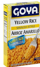
RICE YELLOW GOYA 18/14 OZ #421801