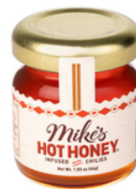
HONEY HOT MINI MIKES HOT HONEY #415266, 12/1.4 OZ