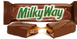
CANDY MILKY WAY BARS MARS 36/2.05 OZ, #134409