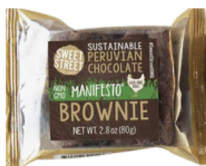
BROWNIE SUSTAINABLE PERUVIAN CHOCOLATE SWEET STREET 48/2.88 OZ #920109