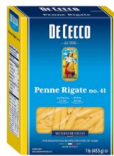
PASTA PENNE RIGATE DECECCO 12/1 LBS #371220