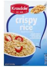
CORN FLAKES KRASDALE 12/18 OZ, #175016