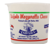
CHEESE MOZZARELLA BUFFALO BALL LUPARA 12/7 OZ #521210