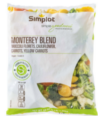
VEGGIE BLEND MONTEREY SIMPLOT 8/3 LB #941508