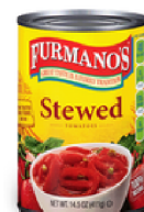
TOMATOES STEWED LRS FURMANO 12 / 14.5 OZ #521282