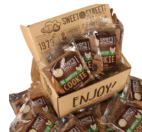
COOKIE IW CHOC CHUNK MANIFESTO SWEET STREET 48/3.02 OZ #160581