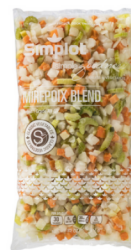
VEG BLEND MIREPOIX DICED FRZN SIMPLOT 12/2 LB #099589