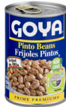
PINTO BEANS LRS, GOYA #920598, 24/15.5 OZ