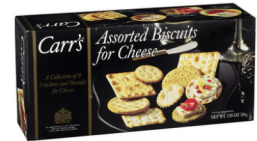
BISCUITS ASSORTED CARRS 12/7.05 OZ #152535