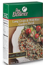
RICE LONG GRAIN AND WILD PRODUCER 6 / 36 OZ #422004