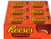
CANDY PEANUT BUTTER CUPS REESES 1/36 CT #134506