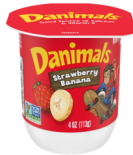
DANIMALS STRAW BANANA DANNON YOGURT 48/4 OZ #041011