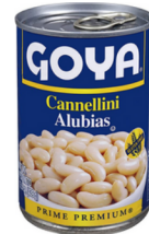
CANNELLINI BEAN WHITE GOYA 24/15.5 OZ #983650