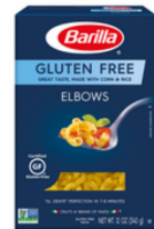
PASTA ELBOW MACARONI GF BARILLA 8/12 OZ #371106