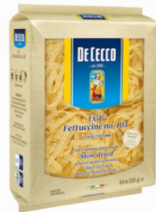
PASTA FETTUCCINE NEST DECECCO 12 / 8.8 OZ #372096