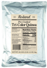
TRI COLOR QUINOA PRE-COOKED ROLAND 6/1 KG #551217