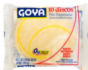
DOUGH EMPANADA WHITE 5 GOYA 24/14 OZ# 931004