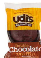
GTF IW DBL CHOC UDIS MUFFIN 36/3 OZ #960650