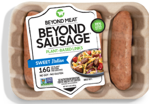
BRAT SWEET ITALIAN VEGAN BEYOND MEAT 50/3.52 OZ #111720