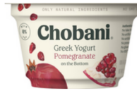
YOGURT GREEK POMEGRANATE FFR CHOBANI 12/5.3 OZ #082167