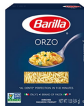
PASTA ORZO BARILLA 16/16 OZ #372084