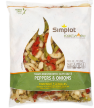
PEPPER ONION BLEND FLAMEROAST SIMPLOT 6/2.5 LB #833088