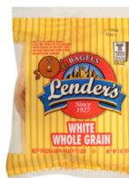
BAGEL WGR IW LENDERS 72/2 OZ #010416