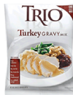
GRAVY TURKEY BASE TRIO 8 / 20 OZ #231209