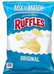
CHIPS POTATO RUFFLES BULK FRITO LAY 8/16 OZ #440601