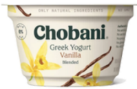
YOGURT GREEK VANILLA FFR CHOBANI 12/5.3 OZ #82148