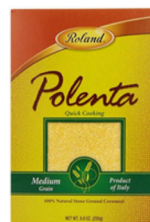
POLENTA YELLOW QUICK COOK ROLAND 12/8.8 OZ, #205049