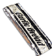
BREAD GARLIC ROCKLAND 1/LOAF #120339