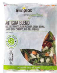
VEGGIE BLEND ANTIGUA BROCCOLI SIMPLOT 8/3 LB #941503