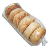
ROCKLAND BAGEL SESAME 1/6 CT #120167 PLAIN 1/6 CT #120165 CINNAMON RAISIN 1/6 CT #120175