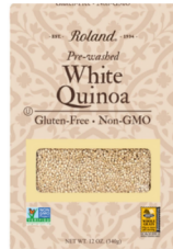
QUINOA WHITE ROLAND 12 / 12 OZ #551216