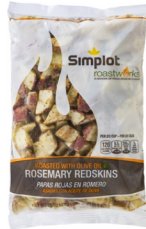
POTATO HALVES RST BABY W/HERBS SIMPLOT, 6/2.5 LB #479156