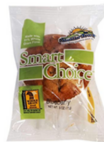
MUFFIN IW WGR BLUEBERRY RDF MUFFINTOWN 96/2 OZ #924825