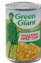
CORN WHOLE KERNEL SWEET GREEN GIANT 24/ 15.3 OZ #530777