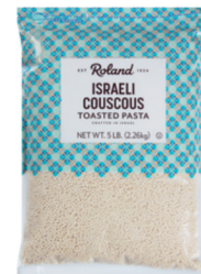
COUSCOUS ISRAELI ROLAND 4/5 lb, #421005